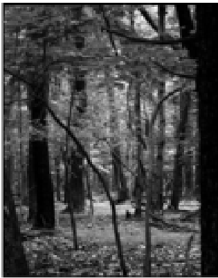
Sleeping Lion Trail, Springfield