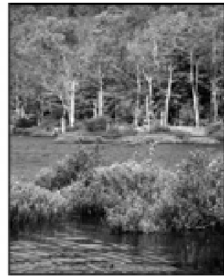
Bear Swamp, Roseboom