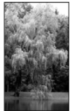
Betty & Wilbur Davis State Park

NOW, MORE THAN EVER, WE NEED YOUR SUPPORT!